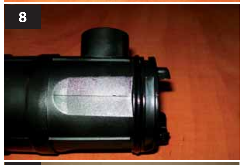
The plug will not be needed – you can put it to the needless parts