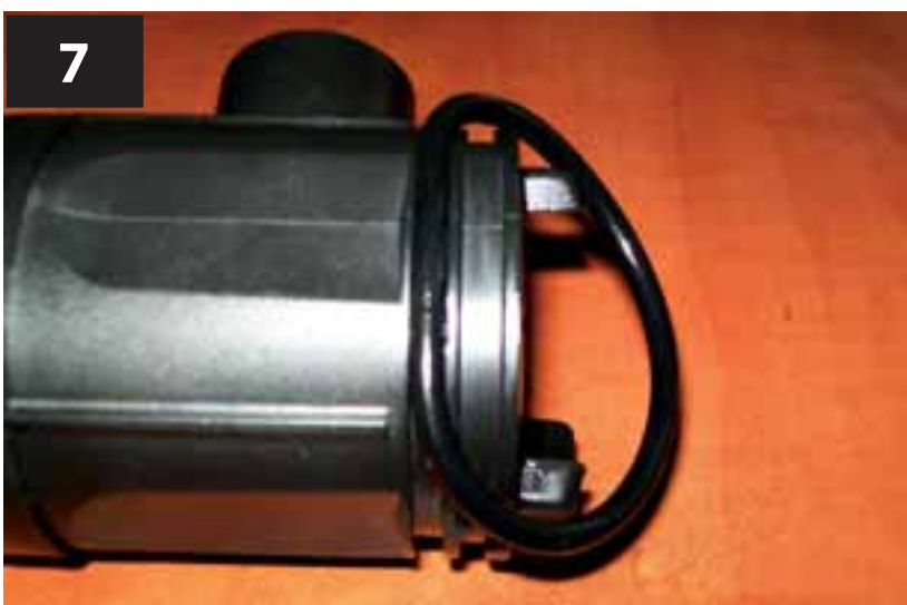
Press it in the groove